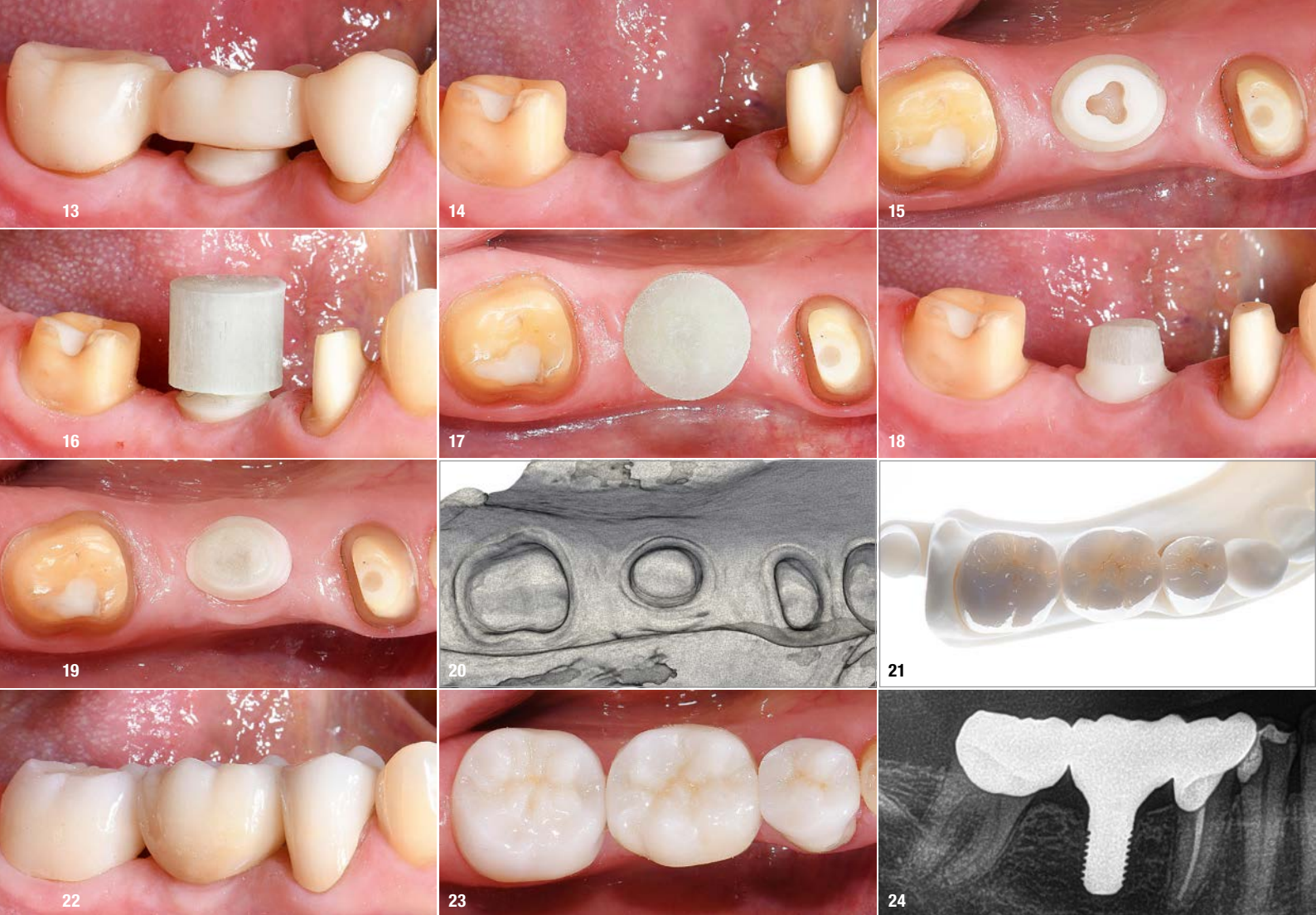
Fig. 13: Clinical situation three months after implant placement. Healing was uneventful. Fig. 14: The implant was stable and the soft tissue presented itself as healthy. Fig. 15: Occlusal view. Fig. 16: For the prosthetic reconstruction a glass fibre post and core assembly was adhesively cemented on the implant. Fig. 17: The post and core assembly is pre-fabricated and tightly fits into the implant connection. Fig. 18: Following this build-up, the implant was prepared for a full-crown restoration just like a natural tooth. Fig. 19: Occlusal view. Fig. 20: An intra-oral scan was performed for a lab-side prosthetic workflow. Fig. 21: Three monolithic zirconia crowns were fabricated (Ceramics: MDT Claus-Peter Schulz). Fig. 22: Intra-oral view of the treatment result. Fig. 23: Occlusal view. Fig. 24: Radiographic evaluation of the treatment result.